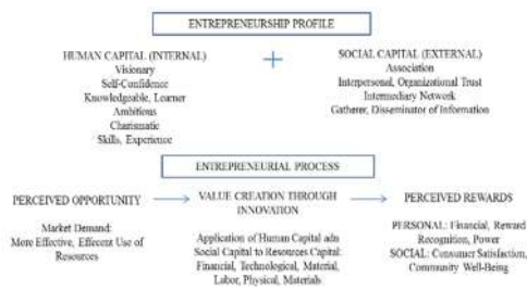
Figure 1. Social capital competency of entrepreneur

Entrepreneurs must have social capital as one of the competence of an entrepreneur (23) because it is primarily formed from relationships with others (external) contributes to the success of a business actor, as Figure 1. Social capital affects the formation of an innovative capacity of an entrepreneur In which the resulting innovation can bring benefits or rewards for itself such as access to information, strength, and awakening solidarity as well as for the community such as information diffusion, task completion assistance for social welfare, created civil society.